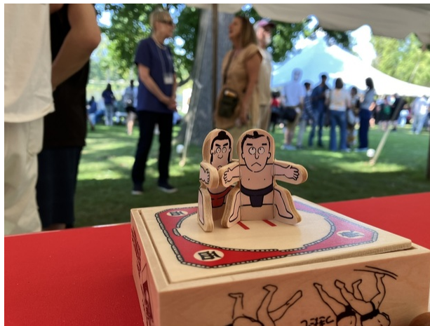
Pictured: Paper Sumo

Festivalgoers were treated to traditional music and dance performances, including taiko drumming and koto, along with a kendo demonstration, offering a vibrant glimpse into Japan's artistic heritage. The JBSD Women's Club gave a beautiful presentation of a sado --a traditional Japanese tea ceremony--adding to the authentic cultural experience of the festival.