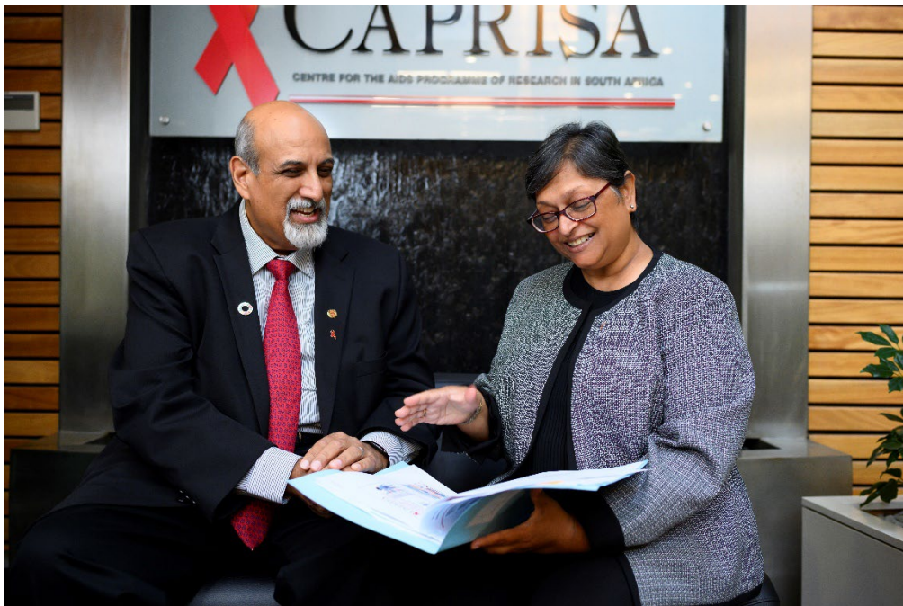
Professors Salim and Quarraisha Abdool Karim at the CAPRISA headquarters located on the Nelson Mandela Medical School campus.

In summary, Drs. Salim and Quarraisha Abdool Karim are world renowned African scientists who have had a marked impact on HIV prevention and treatment as well as the Covid-19 response globally and especially in Africa.