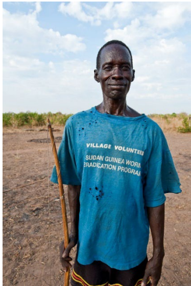
Community-based village volunteers are the frontline heroes of the Guinea Worm Eradication campaign and their dedication and commitment are responsible for the progress: 99.99% eliminated worldwide. Molujore village, Terekeka County, South Sudan

of Guinea worm becoming the first parasite, and the second human disease (after smallpox) to be eradicated in history.