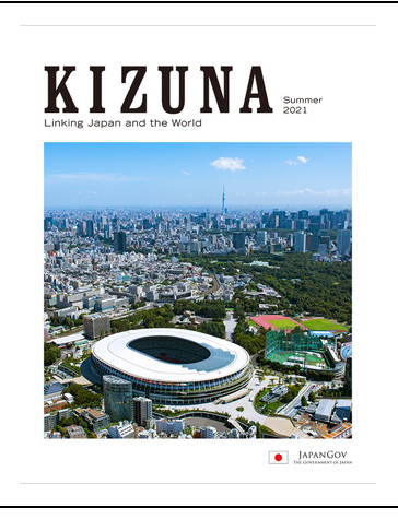
Kizuna is a digital publication of the Government of Japan. It features reports on a wide variety of Japan-related topics, to provide opportunities to strengthen links between Japan and the world.

The official magazine of the Government of Japan: Kizuna